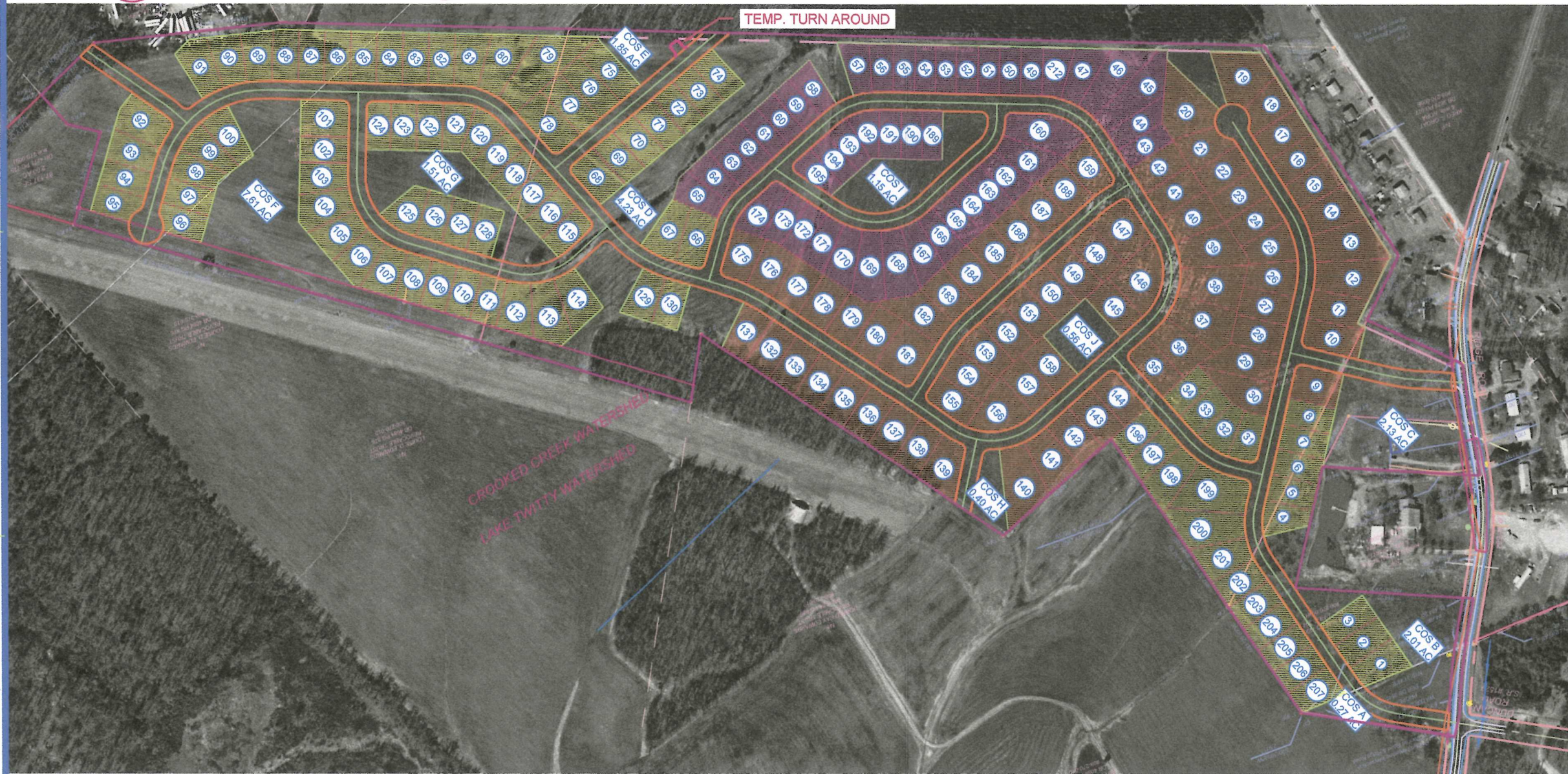
A1 EX A PLAN SCALE: 1"=350'